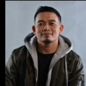
VON ASILO PHILIPPINES

COLLEGE DANCE CREW CHAMPIONSHIP BRINGS YOU RENOWNED DANCE INDUSTRY PROFESSIONALS, INCLUDING CHOREOGRAPHERS, JUDGES, AND CRITICS. PARTICIPANTS WILL GAIN INVALUABLE FEEDBACK FROM THESE EXPERTS, SIGNIFICANTLY ENHANCING THEIR SKILLS. ENGAGING WITH SUCH DISTINGUISHED FIGURES WILL PROVIDE YOUNG DANCERS WITH A SUBSTANTIAL ADVANTAGE, PREPARING THEM FOR SUCCESS BOTH LOCALLY AND ON THE GLOBAL STAGE.